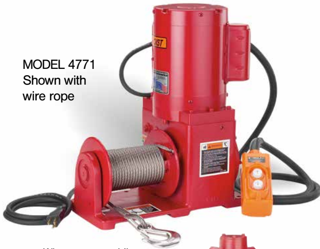
Wire rope assemblies sold separately